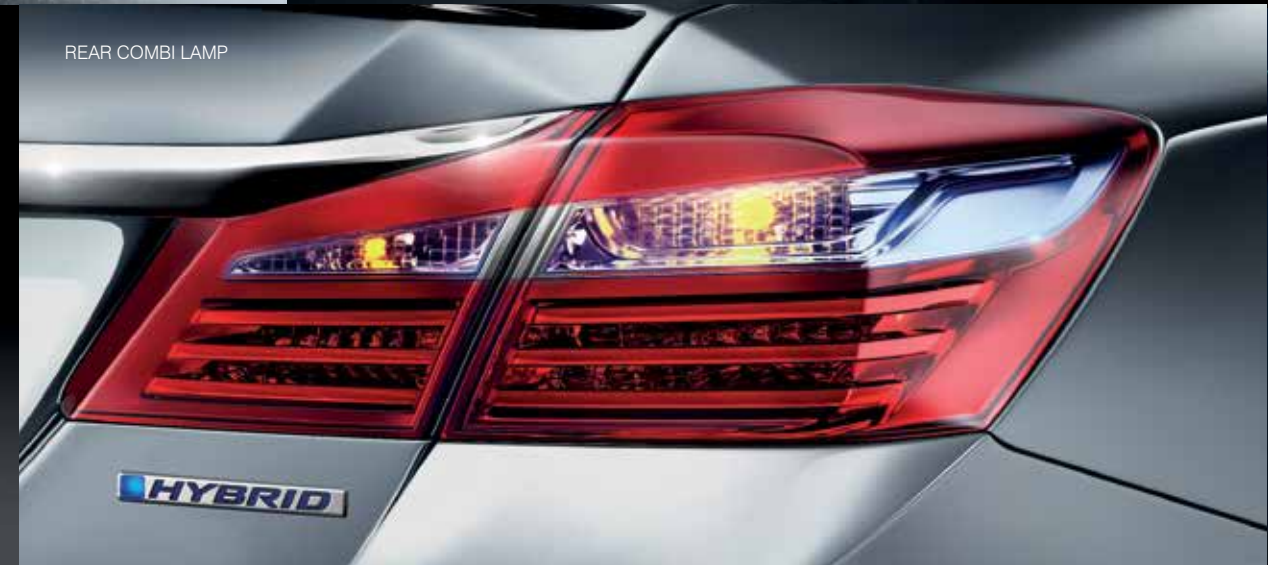
REAR COMBI LAMP