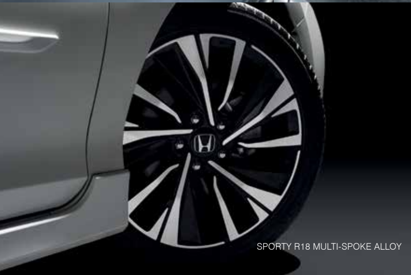
SPORTY R18 MULTI-SPOKE ALLOY