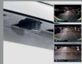
MULTI-ANGLE REAR VIEW CAMERA