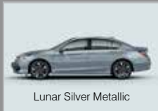
Lunar Silver Metallic