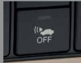
ACOUSTIC VEHICLE ALERT SYSTEM