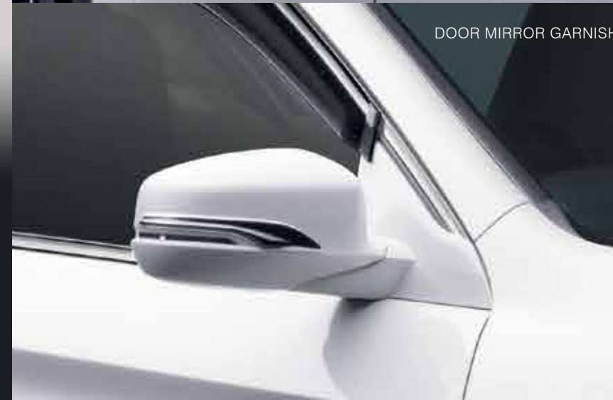
DOOR MIRROR GARNISH