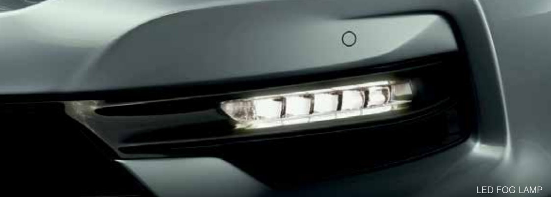
LED FOG LAMP