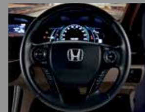
MULTI-FUNCTIONAL STEERING WHEEL