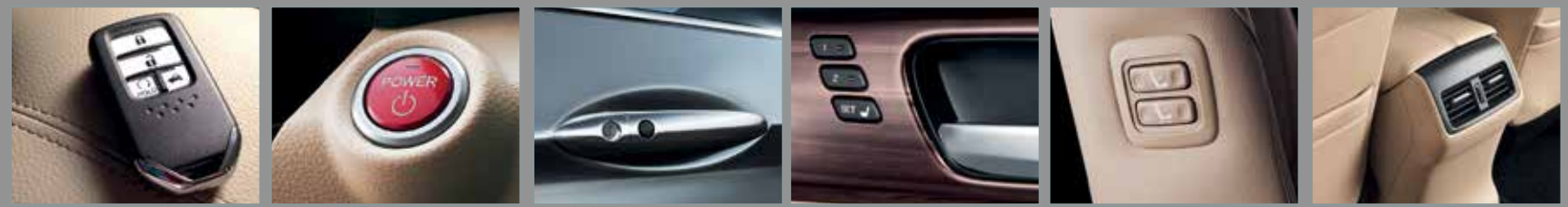
REMOTE ENGINE START ONE PUSH IGNITION SYSTEM SMART ENTRY 8-WAY POWER ADJUST DRIVER SEAT WITH TWO POSITION MEMORY FUNCTION POWER ADJUST CO-DRIVER SEAT REAR AC VENTS

This is the hallmark of a technology leader, one who can seamlessly blend luxury and craftsmanship into the engineering. Human comfort can never take the backseat, in fact everything is designed around the driving experience. The perfection of leather, the premium wood finish, the ultra-luxurious spacious cabin with a host of convenience features, all come together to create an in-car atmosphere that rivals a luxury lounge. Because the Accord Hybrid's technology is what leads the world and its luxury is what leads the heart.