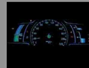
POWER CHARGE METER

Settle into sophistication. A unique in-cabin experience that only a Honda Accord Hybrid can evoke is waiting for you. Innovative technology meets elegant design, making the new Honda Accord Hybrid one of the most amazing feelings. Forget having to tinker with AC controls as the i-Dual Zone automatic climate control system not only creates independent left and right temperature zones but can also judge the sun direction and strength to adjust temperature and air volume automatically. And to top it off, do all of this and more without having to take your hands off the wheels, thanks to the multi-functional leather wrapped steering wheel with mounted controls.