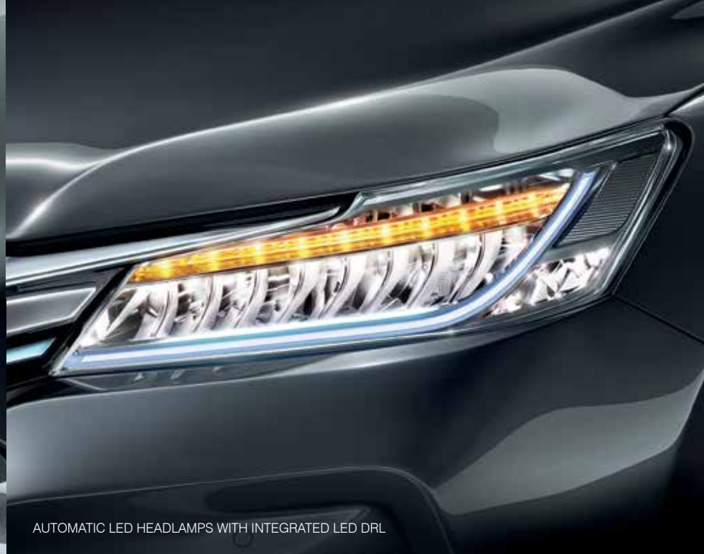
AUTOMATIC LED HEADLAMPS WITH INTEGRATED LED DRL