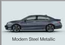
Modern Steel Metallic