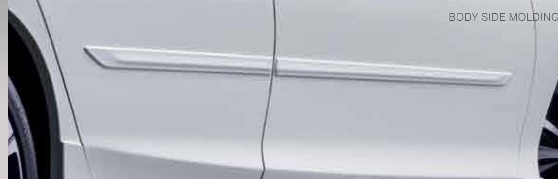
BODY SIDE MOLDING