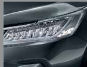
ACTIVE CORNERING LIGHT