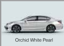
Orchid White Pearl