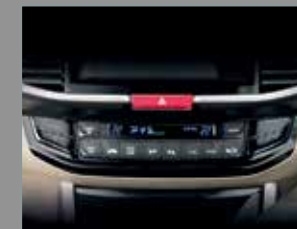
i-DUAL ZONE AUTOMATIC CLIMATE CONTROL WITH PLASMA CLUSTER