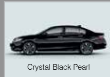
Crystal Black Pearl