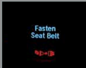
DRIVER & CO-DRIVER SEAT BELT REMINDER