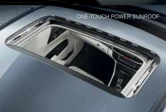
ONE-TOUCH POWER SUNROOF