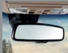
AUTO DIMMING IRVM