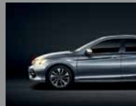
EMERGENCY STOP SIGNAL