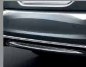
FRONT AND REAR PARKING SENSOR