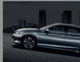
HILL START ASSIST