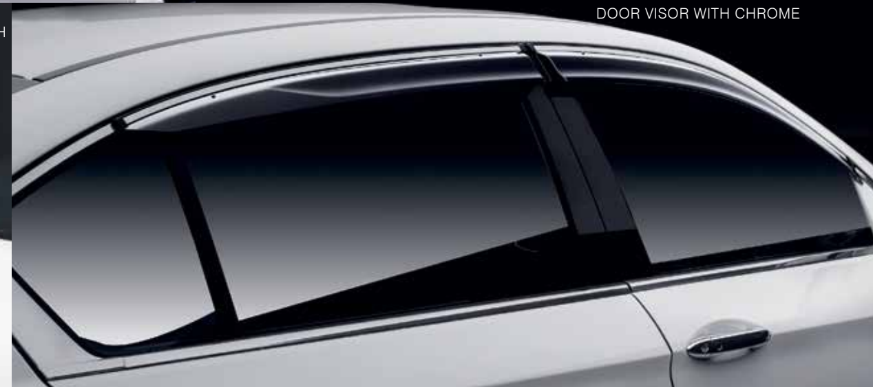
DOOR VISOR WITH CHROME