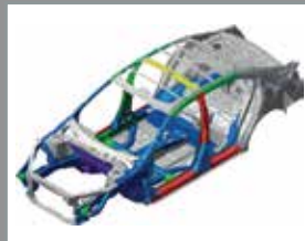
ACE™ BODY STRUCTURE

While every Honda car takes great pride in bringing the most updated safety features, the Accord Hybrid takes safety to the level of art. Not only is the Accord designed to safeguard you, it goes miles ahead to safeguard every bit of craftsmanship that you will cherish in it.